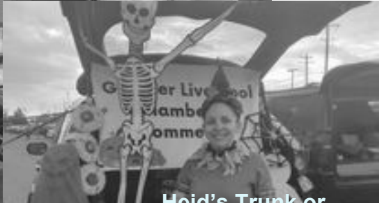
Heid's Trunk or Treat Advocates Incorp Party Davids Refudge