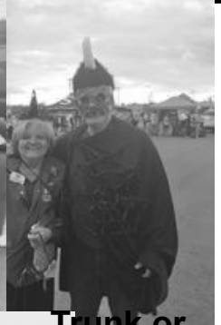
Trunk or Treat Da- vidson Ford of Clay