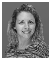
Executive Administrator 315-457-3895 chamber@liverpoolchamber.com Liverpool Chamber of Commerce 314 Second Street, Liverpool, NY 13088