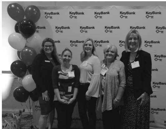
Key4Women Event at the Marriot Downtown (formerly the Hotel Syracuse)