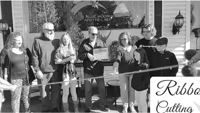
Blue Moon Apothecary, below Isola Cryo Studio and Rosie's Trakside, and right is Freight Yard Brewery!