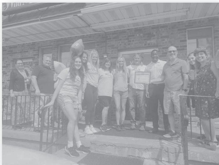
Wild Mix Nutrition Ribbon Cutting